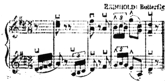
Left: Wood block printing sample from the Sherwood Community Music School Collection

Began as the Sherwood Music School in 1895 and was a degree-granting institution for musicians, a hub for the students of music distance education, and a community music school offering lessons and programs for musicians of all ages. The collection strength lies in its institutional records of the Sherwood Music School from 1906 to 2011 and also contains institutional records, books, programs, and ephemera. Sherwood merged with Columbia College Chicago in 2007. http://digitalcommons.colum.edu/sherwood/