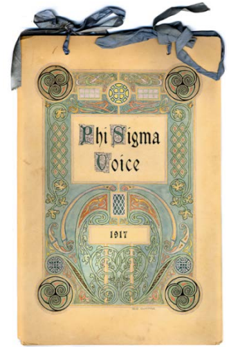
Cover of the 1917 issue of "The Voice" From the Phi Sigma Collection

http://digitalcommons.colum.edu/phisigma/