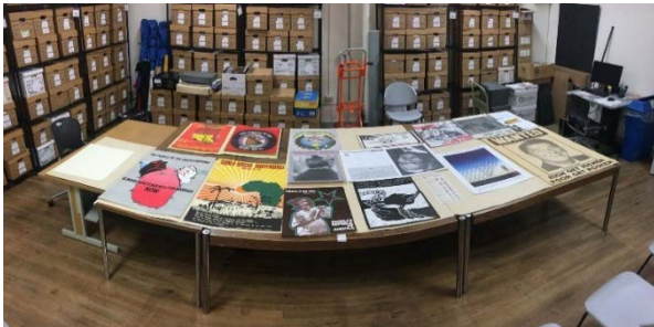
Right: "Guinea-Bissau Independence" poster from the Chicago Anti-Apartheid Movement Collection